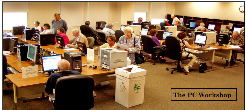
The PC Workshop

By default, the log file created by Dr. Watson is named Drwtsn32.log and is saved in the following location: drive:\Documents and Settings\All Users\WINNT\Application Data\Microsoft\Dr Watson Note Drwatson.exe is an older program error debugger that was included with earlier versions of Windows NT. Microsoft recommends that you use Drwtsn32.exe instead of Drwatson.exe in Windows XP.