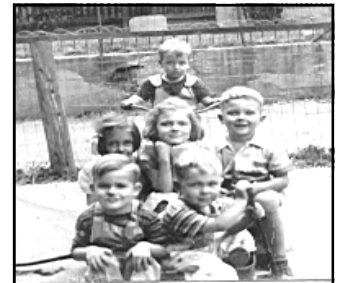
From a 1943 album and can now be shared over the Internet w/friends and relatives.

Not only can you share personal photos, you can also take digital pictures of items in your estate to be assured that each of your family or friends get exactly what you have left for them.